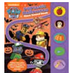
PAW Patrol: PUPtastic Halloween ISBN 978-1-5037-1110-5 ITEM# 7747700

7.84" x 8.86" Board book 6 spreads (5 content)