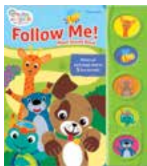
Baby Einstein: Follow Me! ISBN 978-1-5037-1108-2 ITEM# 7747500