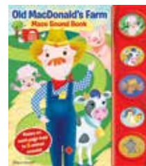
Old MacDonald's Farm ISBN 978-1-5037-1078-8 ITEM# 7746400