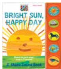
Eric Carle: Bright Sun, Happy Day ISBN 978-1-5037-1109-9 ITEM# 7747600