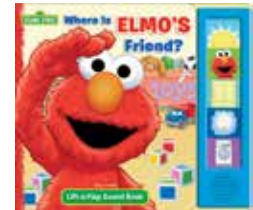
Sesame Street: Where Is Elmo's Friend? ISBN 978-1-4508-8976-6 ITEM# 7702100