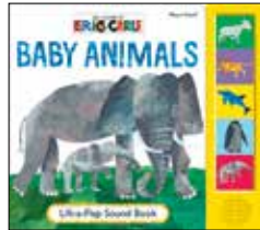
Eric Carle: Baby Animals ISBN 978-1-4508-0508-7 ITEM# 7533500