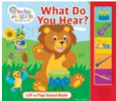
Baby Einstein: What Do You Hear? ISBN 978-1-4508-3376-9 ITEM# 7603700