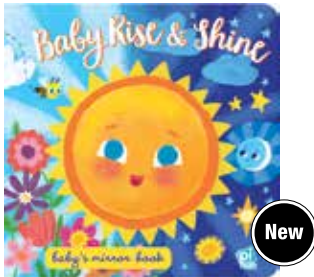
Baby Rise & Shine ISBN 978-1-5037-2736-6 ITEM# 7790100

Mirror play supports social and emotional development