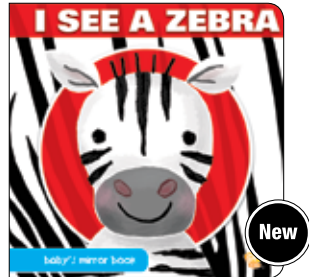
I See a Zebra ISBN 978-1-5037-2735-9 ITEM# 7789900